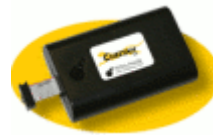
Cheetah SPI Host Adapter